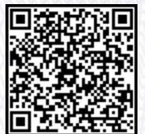
Holly Wise CHAIR

This WRAP certificate covers the facility with the address and production processes listed above. Please refer to the full audit report for details.